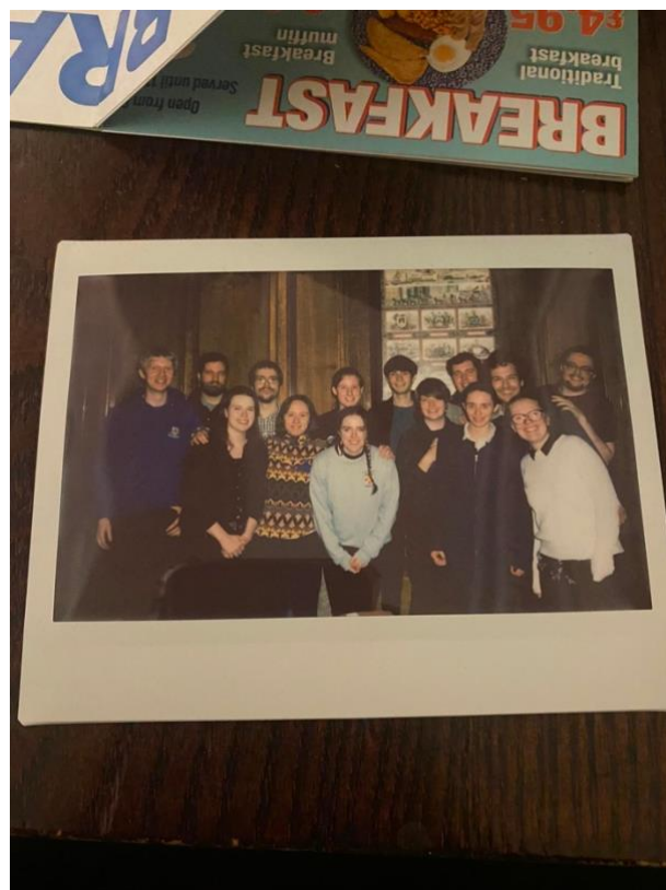
Polaroid in Spoons pre 2021 Dinner