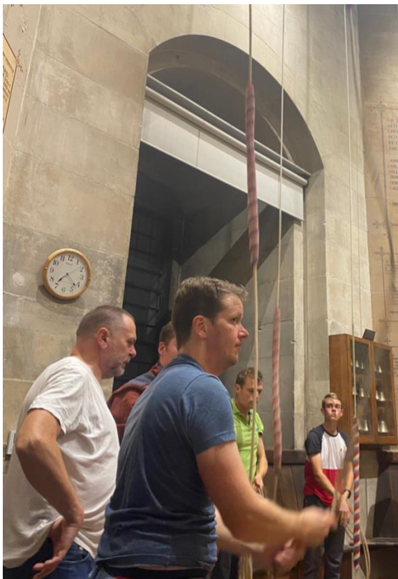
The UL at St Pauls, October 2021