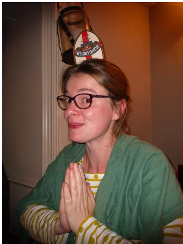
Bishop Jenny on 2021 Summer Tour