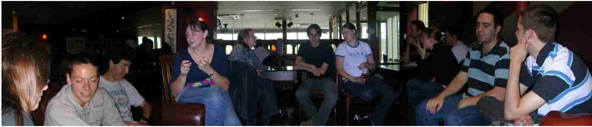
Autumn Freshers' Tour