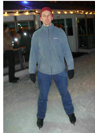
Ice Skating – Somerset House