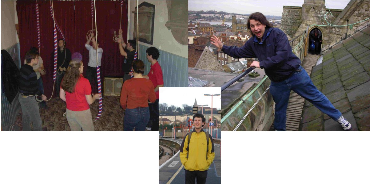
Spring Term Freshers' Tour