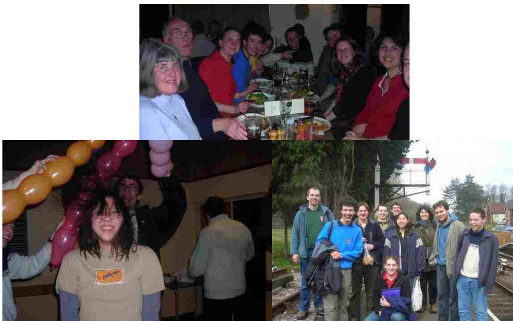
Somerset Weekend Tour