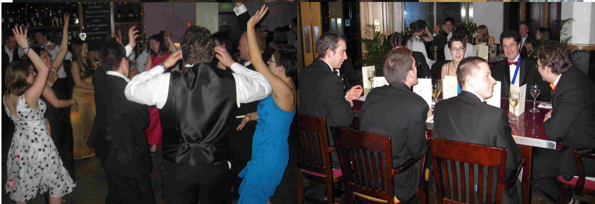
61 st Annual Dinner