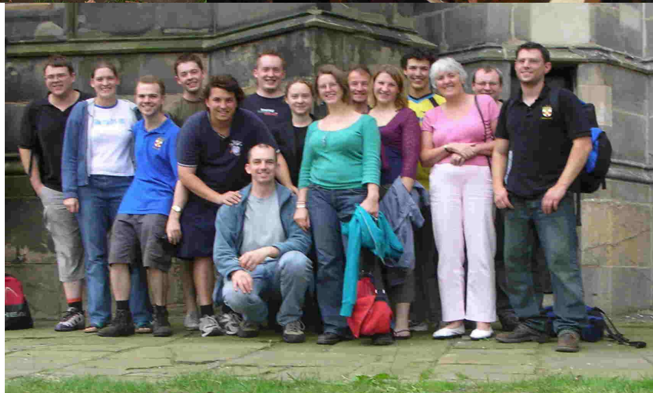
Summer Tour to The West Midlands