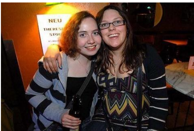
UL girllies invading Austria!

Wo sind die Toiletten? = Where are the toilets?