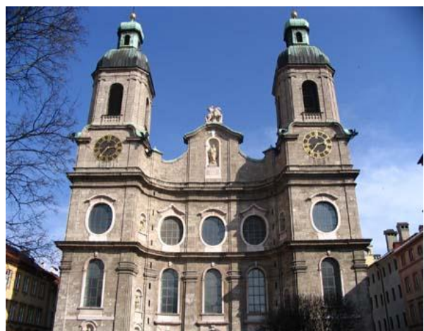
Cathedral Church of St James, Innsbruck... Hart Street sound better on Sunday mornings!